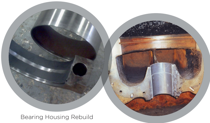
Bearing Housing Rebuild