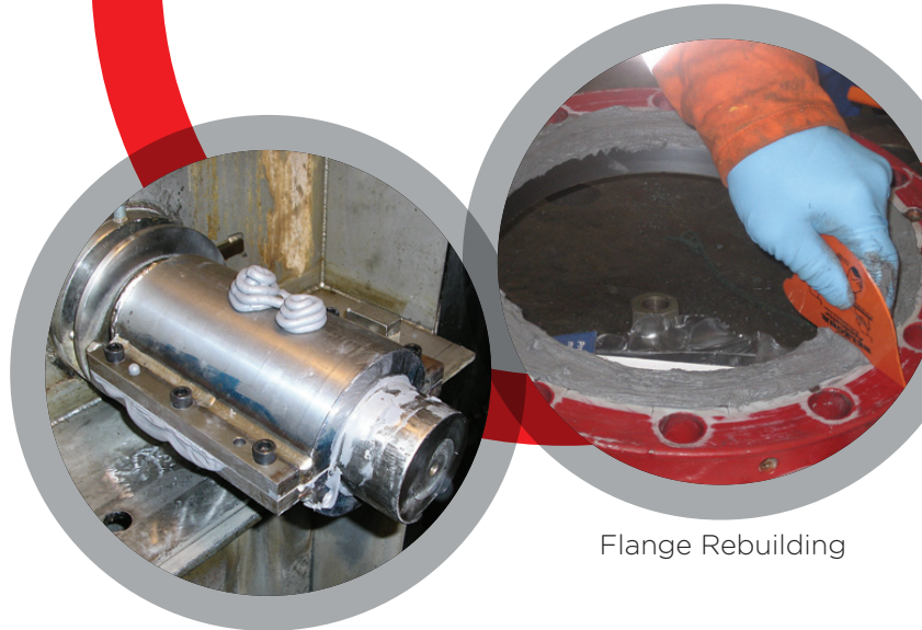
In-situ Shaft Forming